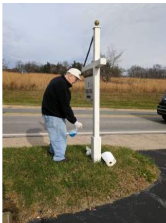
Tom is sprucing up one of our church signs.